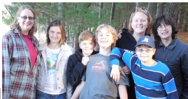
People's Mystic Lake Middle School UU Retreat Gang